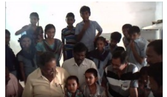
Test call at Vavilala center, Andhra Pradesh