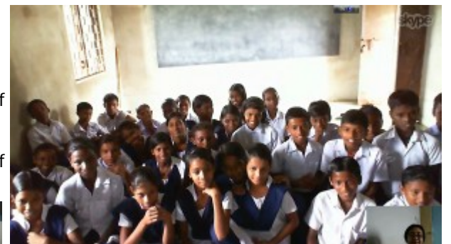
First call from our 2nd West Bengal center Chargali.