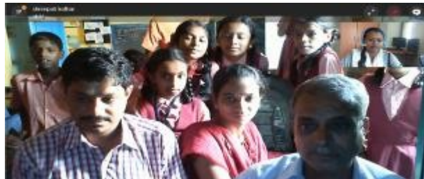
Test call at Hanumakoppa center, Karnataka

New center test calls that happened in the month of September is given below.