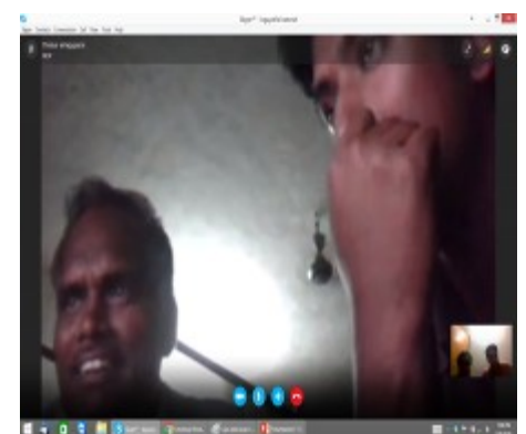
Test call at Thenur center, Tamil Nadu

We have compiled details from our 5 running states to give an overview on the number of sessions that have been delivered in the past 3.5 months of class delivery. The table below will give more insights into the number of center and sessions delivered.