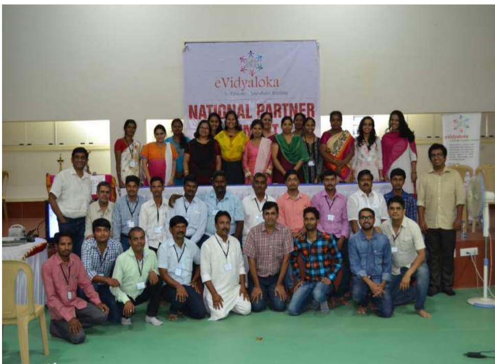
Team eVidyaloka with Local NGO partners and Co-ordinators

To mark the very cause of eVidyaloka, who are kids and quality education to the rural kids, 2 kids per partners and hence 18 kids from all over the country were awarded. Medals and certificates for their consistent academic excellence.