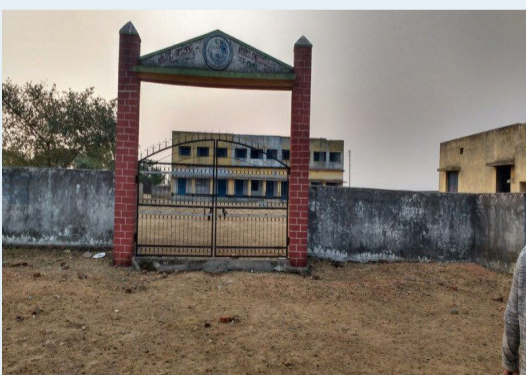
Main Gate of the School